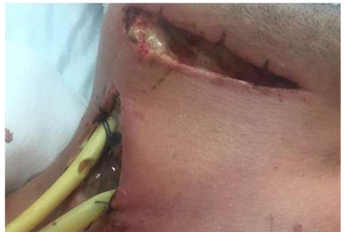
Figure 3. Wounds condition after few days of initial management. No improvement in wound healing.

Briefly, a standard V.A.C. Dressing System (KCI Medical, San Antonio, USA) was applied. Then, polyurethane (PU) foam was trimmed to an appropriate size. To prevent from ingrowing of granulated tissue within PU foam, a contact layer (Acticoat, Smith & Nephew Ltd, UK) was used and sutured to the PU foam. After flushing, the undermined cavities and wounds with antimicrobial solution, a superficial debridement of fibrin, and non-viable tissue was made. Then, PU foams covered with the contact layer were precisely applied within the wound bed and secured with stoma paste (Stomahesive paste®, ConvaTec, USA). Octeniline® (Schulke, Warsaw, Poland) was used as an antimicrobial solution.