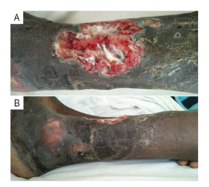
Figure 2. A) Anterior view of the wound. B) A view of the wound laterally. Arrow points to an abscess

It has been reported that a low-cost negative pressure wound therapy can be beneficial to the patients with chronic wounds of the lower extremity in lower socioeconomic groups.4 In comparison to our study, it was based on an Indian population and the negative pressure was achieved by connecting the suction tube to a vacuum in the wall, not to the suction machine. Despite its adequacy, it has to be stated that the study had to be withdrawn because of the lack of ethics committee approval. The lack of support from official producers is only one of many obstacles to implement NPWT in Sub- Saharan medical facilities successfully. Collection, preparation, and adjustment of the whole improvised NPWT machine lasted a whole day long. Covering the wound took almost an hour itself due to the technical difficulties. The local medical staff definitely needs a thorough training in NPWT and chronic wound therapy. However, we still believe