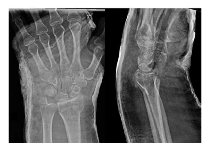
Figure 4. condition after closed repositioning of fracture and application of plaster fixation

Neurological complications with an indication of 5.7% are listed as the most common, including carpal tunnel syndrome and CRPS. It also lists tendon injuries (3.5%) and complications associated with the implant (1.6%).<sup>8</sup> In our cohort, we observed complications in only 10% of cases, as illustrated in (Tab. III).