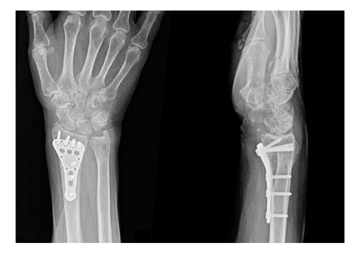
Figure 9. Radiological imaging following osteosynthesis (3 months)