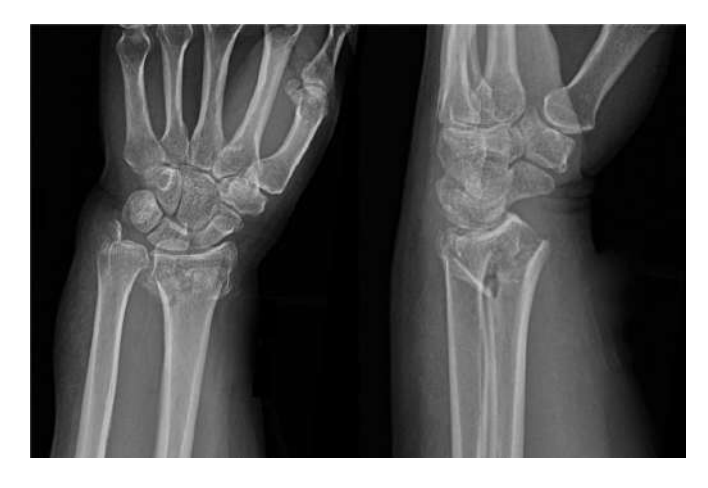
Figure 3. Fracture of distal radio in AP (left) and lateral (right) projection