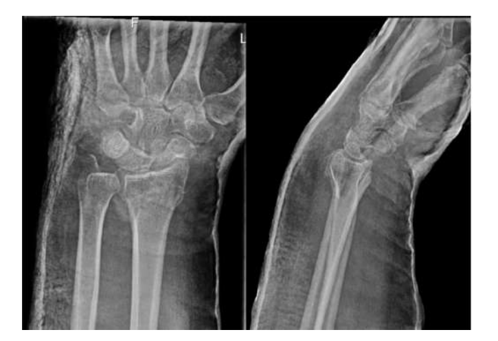
Figure 5. X-ray imaging 2 weeks after repositioning

Most often it was osteosynthesis failure, in less than 4% of cases. Particularly problematic are the fractures affecting the most distant part of the cortical bone, where anatomical repositioning and stable fixation of the distal series of screws are difficult to achieve. Complications in these fractures can be avascular necrosis of small fragments of the joint area with intra-articular screw dislocation (Fig. 10). In the therapy of this complication, extraction of osteosynthetic material with subsequent rehabilitation care is indicated. Due to the fact that the joint surface is affected, the functional results tend to be worse than in extraarticular fractures. Of the neurological complications, the most common was a form of nervus medianus disability, from simple paresthesia to development of the carpal tunnel syndrome. We observed complex regional pain syndrome in two patients. Nerve deliberation was indicated in only one case. Nerve injury