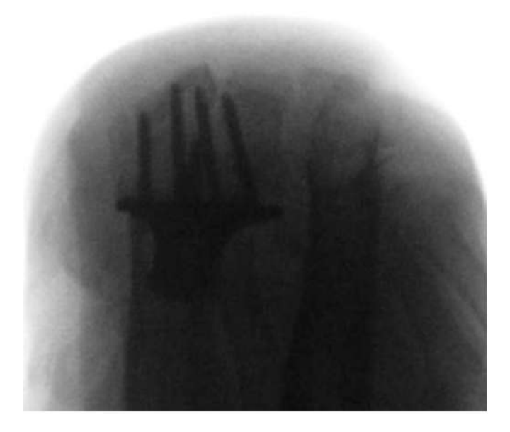
Figure 8. Radiological imaging of the distal screws ("Skyline" projection , post-surgical documentation)