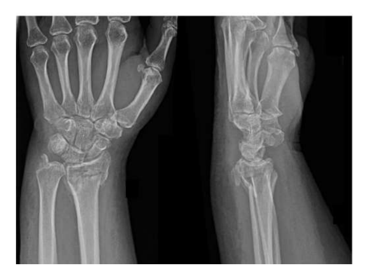
Figure 6. X-ray imaging after removal of plaster fixation and start of rehabilitation (5 weeks after repositioning)

can be a result of both fracture and medical treatment. It is therefore important to properly examine and document neurological status before initiation of any treatment.