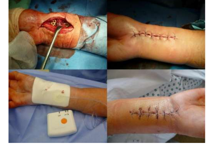
Figure 11. ciNPT system application and the therapeutic result