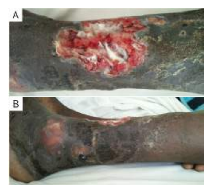
Figure 2. A) Anterior view of the wound. B) A view of the wound laterally. Arrow points to an abscess

It has been reported that a low-cost negative pressure wound therapy can be beneficial to the patients with chronic wounds of the lower extremity in lower socioeconomic groups.<sup>4</sup> In comparison to our study, it was based on an Indian population and the negative pressure was achieved by connecting the suction tube to a vacuum in the wall, not to the suction machine. Despite its adequacy, it has to be stated that the study had to be withdrawn because of the lack of ethics committee approval. The lack of support from official producers is only one of many obstacles to implement NPWT in Sub- Saharan medical facilities successfully. Collection, preparation, and adjustment of the whole improvised NPWT machine lasted a whole day long. Covering the wound took almost an hour itself due to the technical difficulties. The local medical staff definitely needs a thorough training in NPWT and chronic wound therapy. However, we still believe