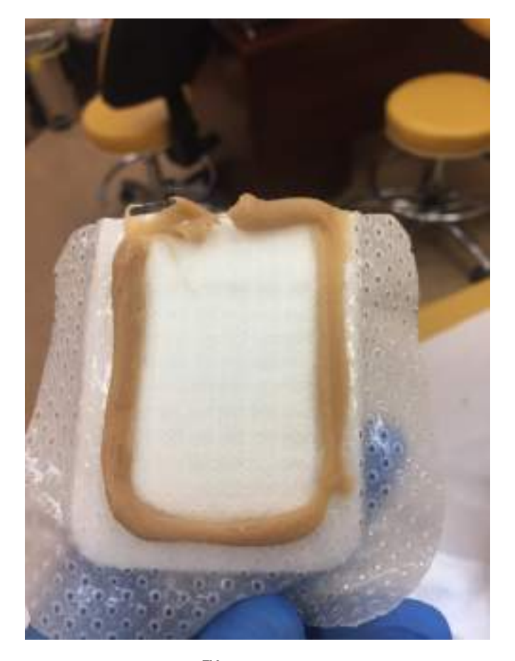
Figure 3. The Hydrofiber^{TM} negative pressure wound dressing with a sealing stoma paste "frame".

infiltration, reducing wound infection rates, and inducing an ordered collagen arrangement.<sup>15</sup> In the head region NPWT can also be effectively used in patients with osteoradionecrosis.<sup>16</sup>