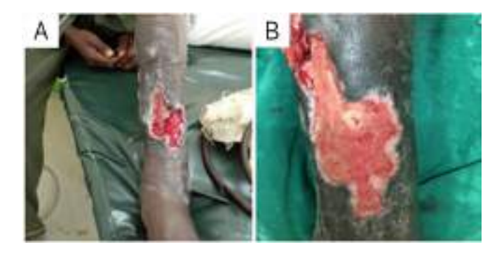
Figure 3. A) The wound after 3 days of continuous NPWT. C) The wound a week later, after debridement and dressing change.

that concerning the great percentage of diabetic foot and limb amputations,<sup>5</sup> pressure ulcers,<sup>6</sup> and a high percentage of HIV-positive individuals in Kenyan population<sup>7</sup> introducing the NPWT would be beneficial for patients and medical workers alike.