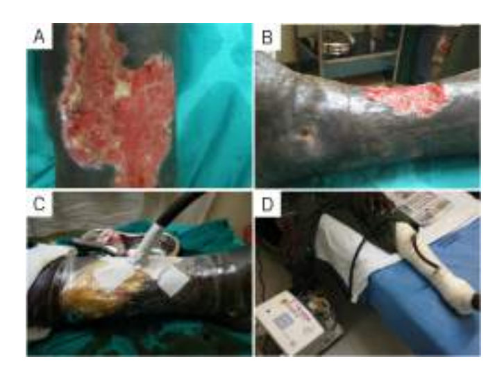
Figure 1. Components of the improvised NPWT, a dishwashing foam and a breakfast foil were used. B) Wound bed prepared for NPWT. c) A foam, breakfast foil and suction tube applied.D) A completed dressing

to -150 mmHg and observed the system for any signs of pressure drops. The patient did not report any discomfort during the treatment. He could move to the suction unit without interrupting the work of the device. 3 days later, we revised the wound and noticed a significant vascularization and granulation on over half of the wound's surface. There was less pus, the inflammation did not progress and the healing process after those 3 days was faster compared to the previous 1 week of moist dressing therapy. The exudate diminished and inflammation shrank.