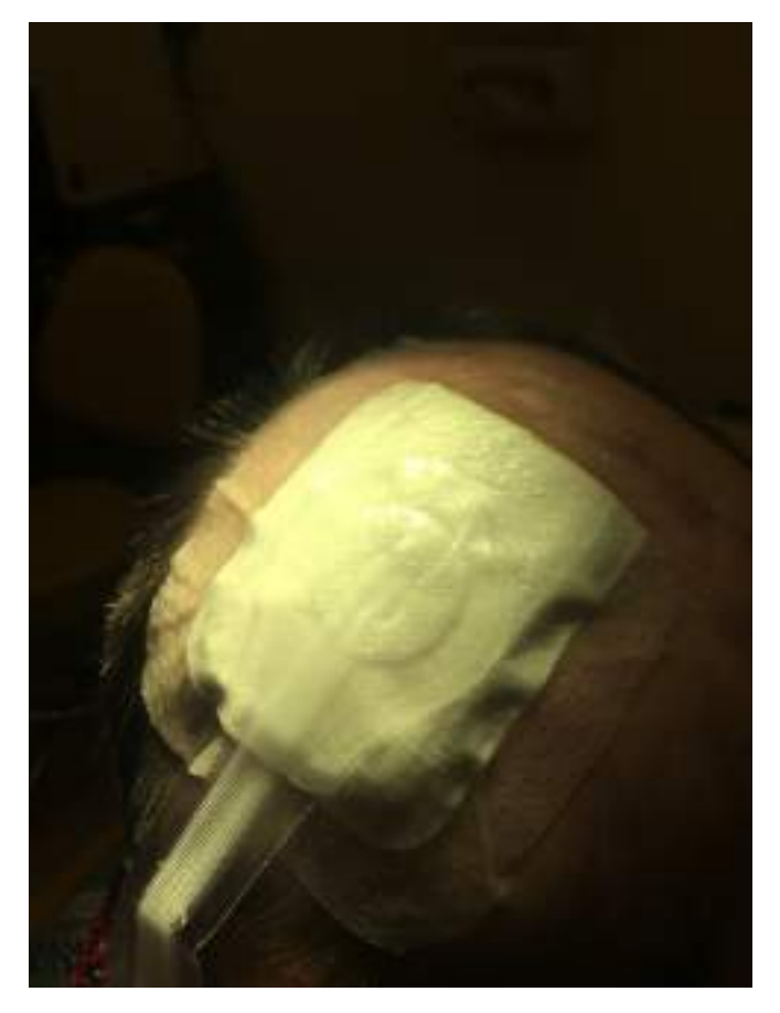
Figure 4. The scalp after introducing the portable negative pressure wound therapy system

In our case, we used the Avelle<sup>TM</sup> (Convatec; UK) system, recently introduced into the medical market.<sup>19, 20</sup> Avelle<sup>TM</sup> uses Hydrofiber<sup>TM</sup> dressings and the pressure used in therapy is a continuous -80 mmHg. The very common technical problem with application of the dressings, also NPWT dressing, is the curvature of the body region. Location of the NPWT system on the skull was uncertain, therefore, to avoid decompression, we decided to use the stoma paste. This modification, improved the seal and prolonged the time between wound dressing changes as described previously.<sup>21, 22</sup> It is most commonly combined with standard "big wound dressings" based on the polyurethane sponge and canister-